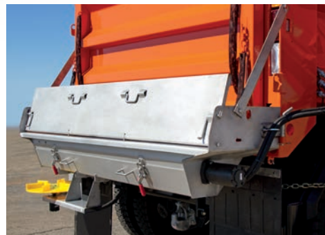
Direct drive design minimizes maintenance and allows independent control of auger and spinner.