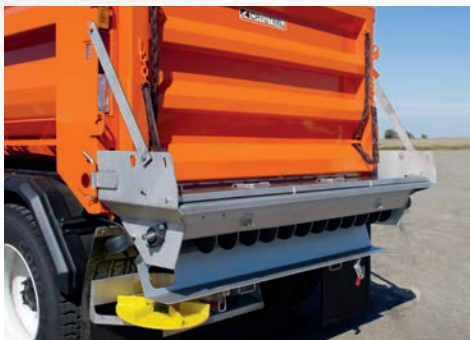
Full opening bottom trough hinged on body side for accessibility and complete clean out.

The Crysteel Stainless Steel Tailgate Spreader was specifically designed to meet the highest demands for efficient performance and dependability all winter long. Corrosion-resistant stainless steel material delivers unmatched durability in the toughest environments. Plus the tailgate spreader is backed by an industry leading 2 year warranty.